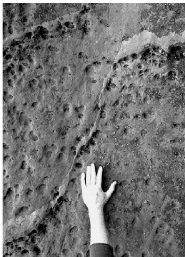
Fig. 1: Normal fault with vertical displacement of ca. 60 cm contained within poorly lithified, medium bedded, sand-clay Miocene turbidites of the Taranaki Basin, New Zealand. A continuous clay smear connects the foot-wall and hanging wall sides of an offset clay unit. The clay smear varies in thickness partly arising from synthetic Riedel shears within the fault zone. Modified from Childs et al. (2007).

model is also consistent with recent studies of high quality outcrops which illustrate how the combined effect of host rock rheology and prevailing deformation processes is capable of generating the full range of fault rock types, including those which have a major impact on hydrocarbon flow, such as shale/clay smears within poorly consolidated sediments (Fig. 1) through to shaley fault