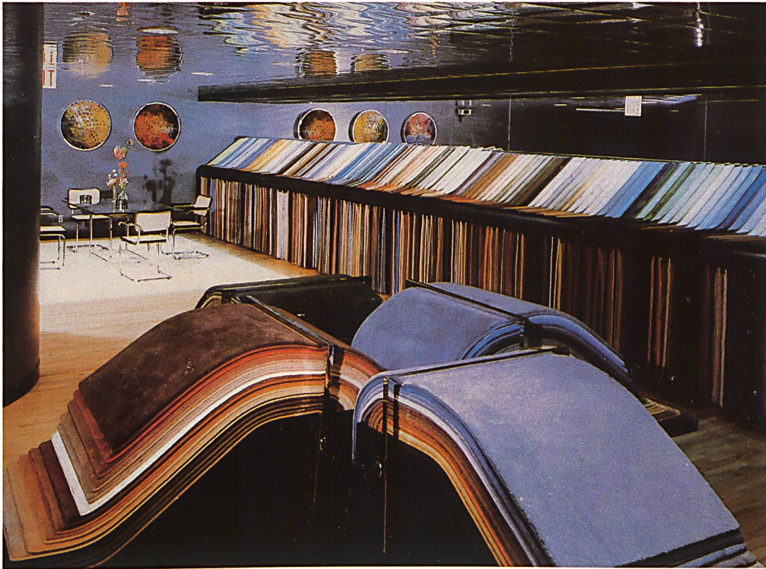
The Broadloom Department – featuring lateral and vertical waterfall displays.

As opposed to the broadloom department, the Oriental department on the lower level projects quite a different mood. Designed in the style of an old-fashioned bazaar with carpets stacked, rolled or hung at random, it features large open floor spaces to spread rugs for viewing and quartz lights to simulate daylight.