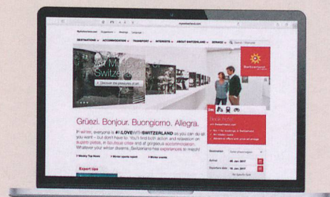
MySwitzerland.com set a new record, with over 30 million visits.

** Number of followers on Facebook, Twitter, YouTube, Pinterest, Instagram, Tumblr, LinkedIn, Vine, Weibo, Ren Ren, Google+, WeChat