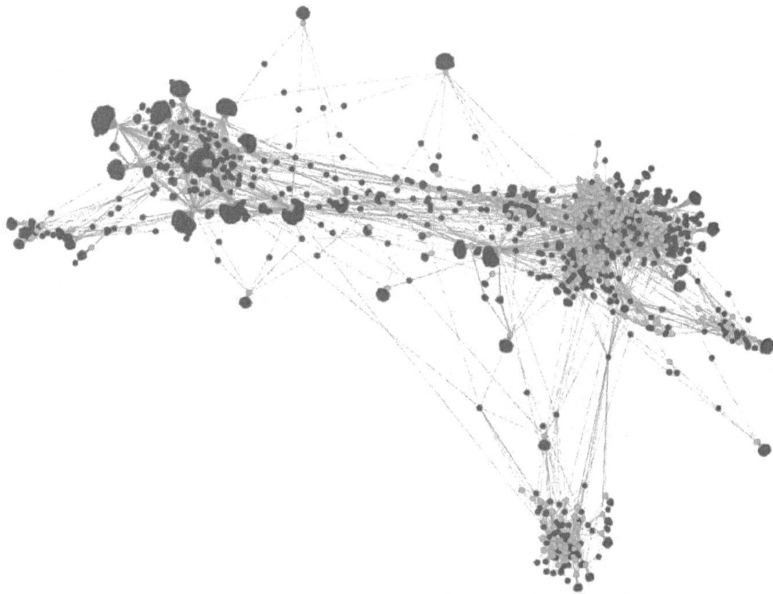
Figure 3: The Swiss Alpine conservation movement, 1980–2005. Visualization made with Gephi (version 0.9.2); grey: person, light grey: event; algorithm: ForceAtlas 2.

reporting can provide insights. In our case study, the analyzed events such as board meetings and academic conferences were recorded on attendance sheets or meeting minutes. In discussing the possibilities and limitations of two-mode networks in historical research, we will refer to our research on the Swiss Alpine conservation movement. Our observations on the application of two-mode networks can be divided into three main points.