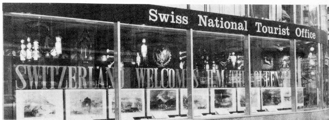
This is how the London office of the SNTO marked the royal tour

THE hills and dark forests of the Jura tempt the holidaymaker to take a break from the daily round. One way to see the romantic Ajoie region, the Alsace and the Laufen Valley or the Franches Montagnes at a comfortably slow pace is to explore it by gipsy caravan. The tours last seven or eight days and are available until October.