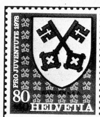
Wangen a. d. A. (BE)