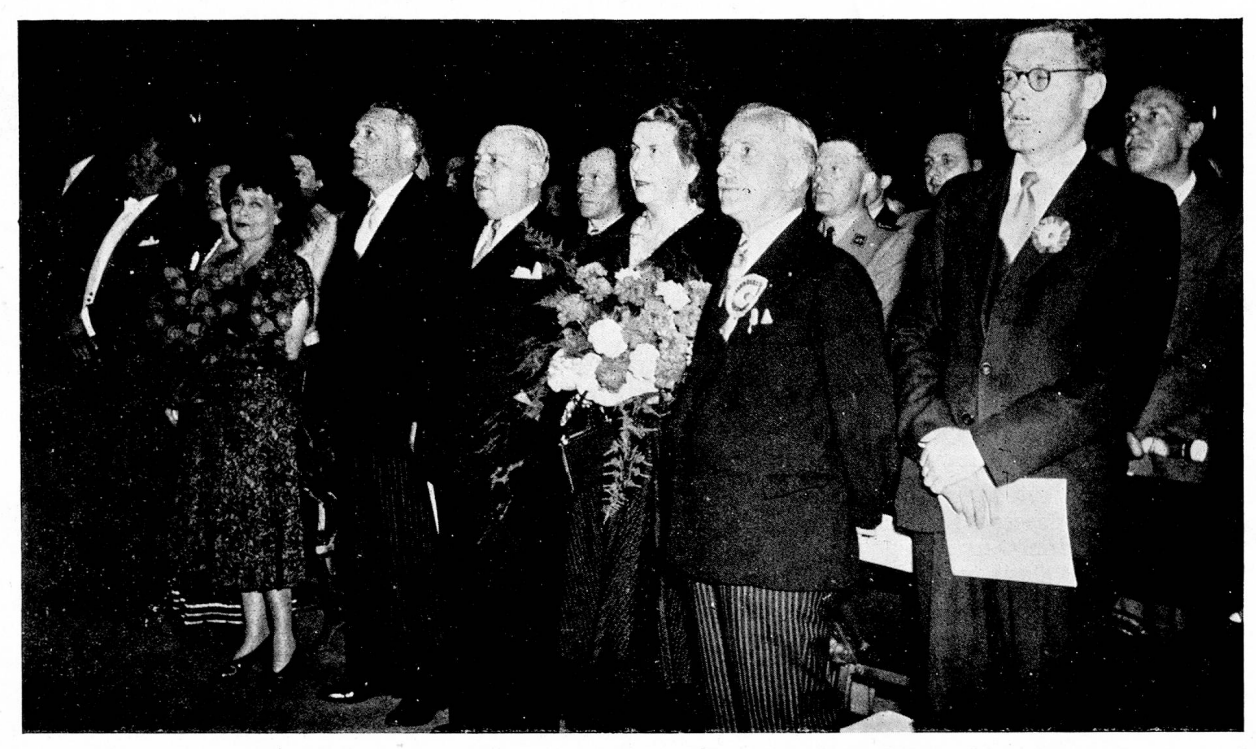
"THE SWISS NATIONAL ANTHEM"