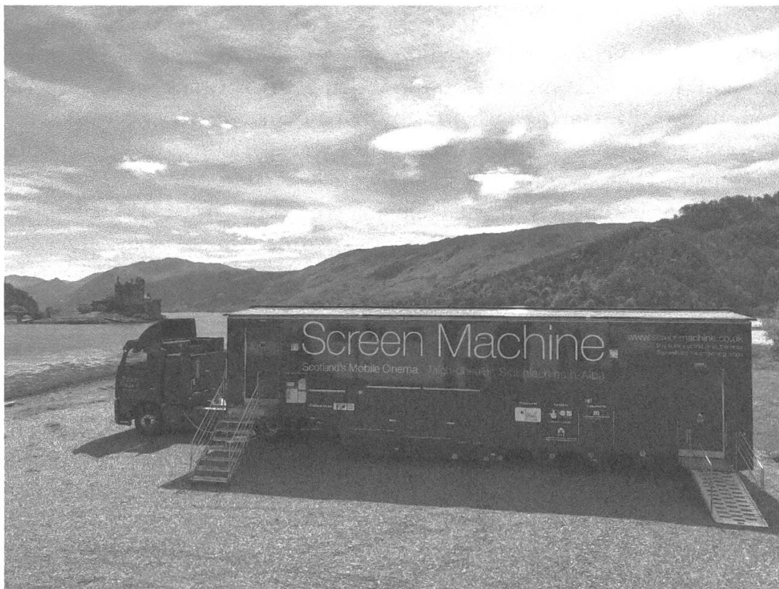
Fig. 3. The Screen Machine in Dornie with Eilean Donan Castle in the background

In 1998 a new version of mobile cinema was unveiled in the form of the Screen Machine, a purpose-built cinema vehicle that promised to deliver the latest films on 35mm to rural areas of the Highlands and Islands of Scotland. The idea of a wholly self-contained mobile cinema that removed the need for spaces that could accommodate a film show originated in France. A partnership of Highlands and Islands Enterprise, the Scottish Film Council and the then Highland Regional Council was formed to adapt and transfer the Cinemobile model from France. The consortium agreed to commission a Highland equivalent of the Cinemobile, financially supported by the National Lottery Fund. A body called HI-Arts was formed to take forward the commissioning process that would eventually lead to the launch of the Screen Machine (Livingston).