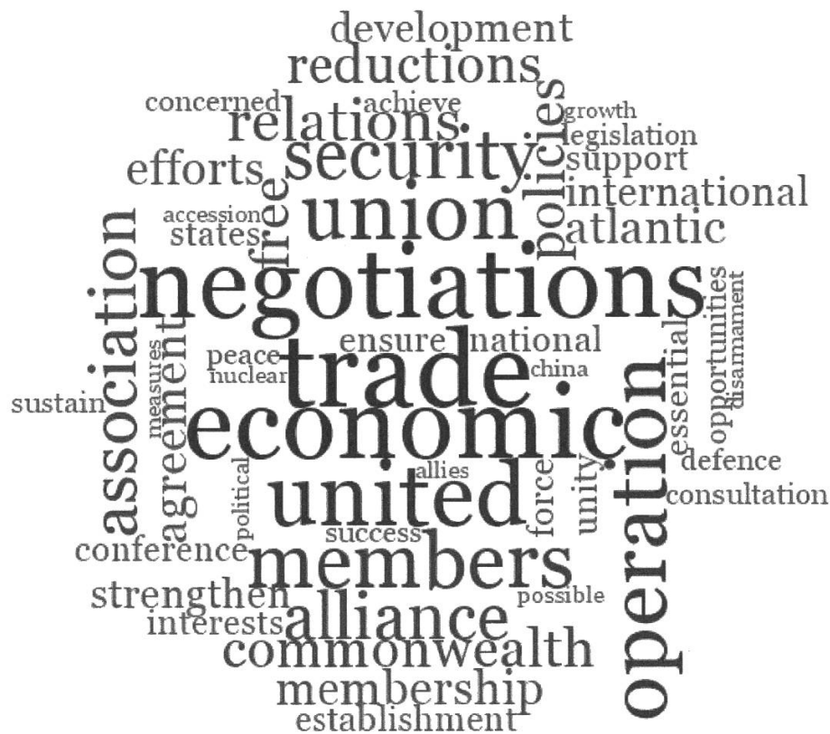
Fig. 2. The fifty most frequent terms used in the Queen's Speech in association with the European Union

Our deliberate engagement with all speeches allows us to position the semantic domains of ‘economy’ in the wider societal context of the speeches. As mentioned above, ‘security’ is one of the key consistent messages, but ‘economy’ is far more pronounced. We show how the relationship between Britain and the EU, enacted in and through the speeches, has been consistently about specific domains of economic activity and not broader European values, although the continuity and relative stability of the genre would be suitable to strengthen European identification, if the Governments over the years had decided to foreground a strong pro-European stance (see Declaration ). EU membership, however, has always been a contentious issue on political agendas regardless of which political party was in Government. Through the cases and the excerpts below we illustrate core patterns in the data and demonstrate how the primary relationship between Britain and the EU is constructed as an economic agreement rather than a, more broadly, political one. Let us start with the first referendum.