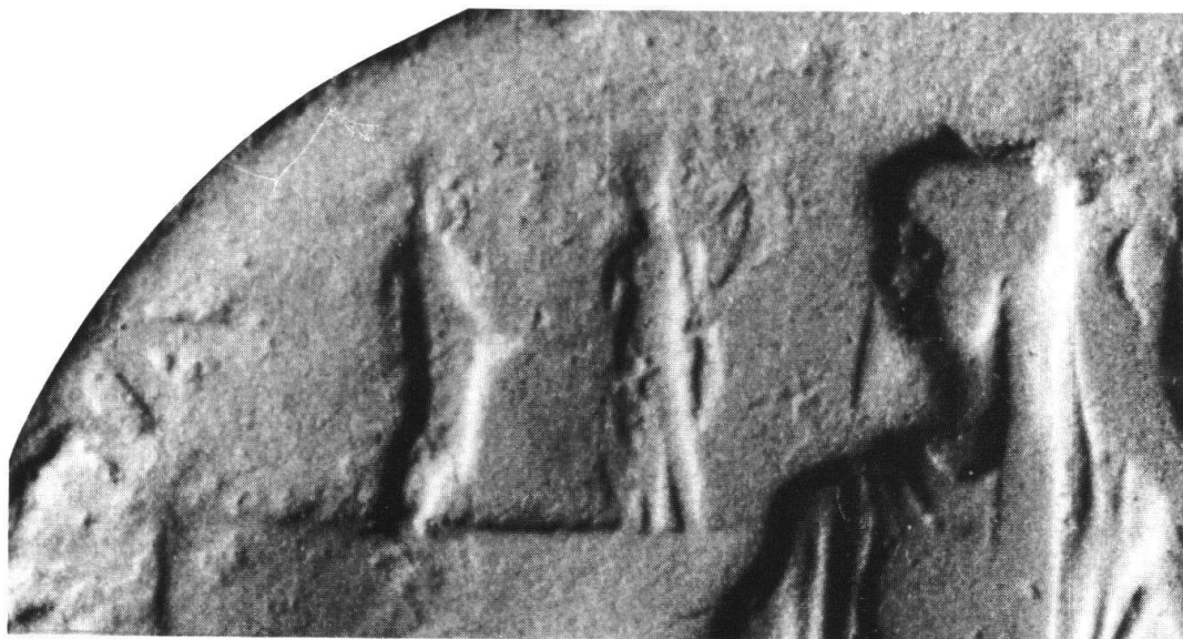
Fig. 1 (detail)