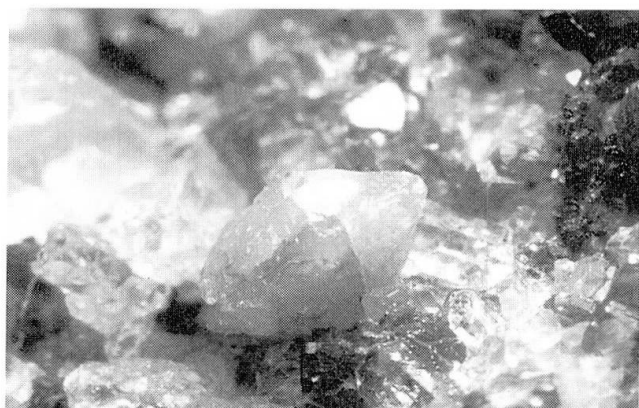
Fig. 3 Picture of a crystal of paraniite-(Y) (size 3 mm).

It was recently found that, under high pressure, zircon ( \text{ZrSiO}_4 ) undergoes a phase transition to a scheelite-type modification; this also happens for other substances with the same structure, e.g. for wakefieldite ( \text{YVO}_4 ) and the corresponding synthetic REE vanadates (KNITTLE and WILLIAMS, 1993, and references therein). On these grounds, a similar transformation can be expected to occur for xenotime ( \text{YPO}_4 ) and chernovite