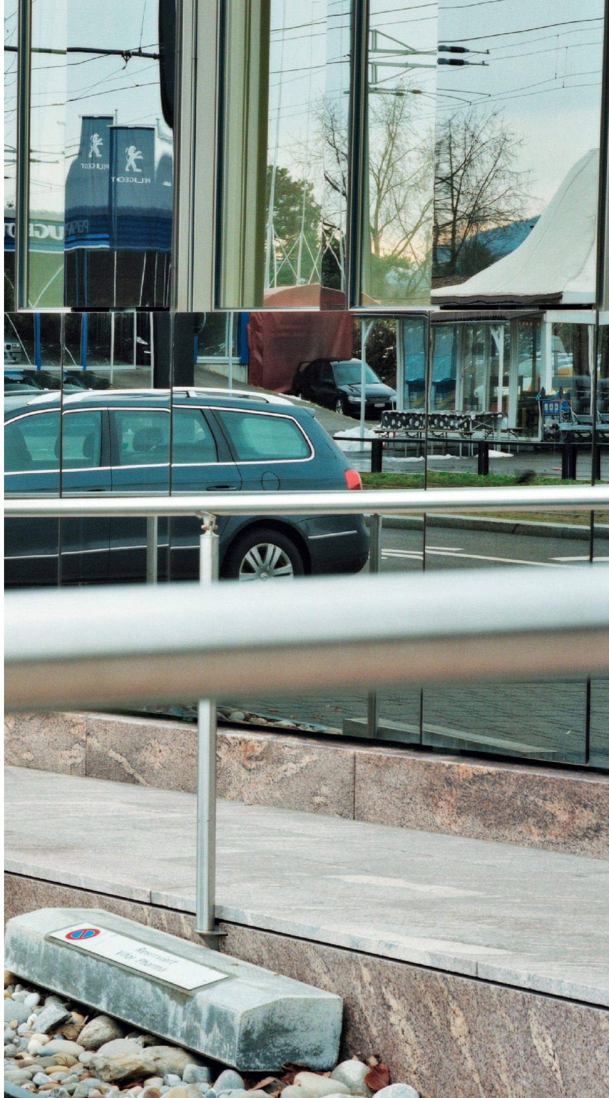
05 The Glattal tramway