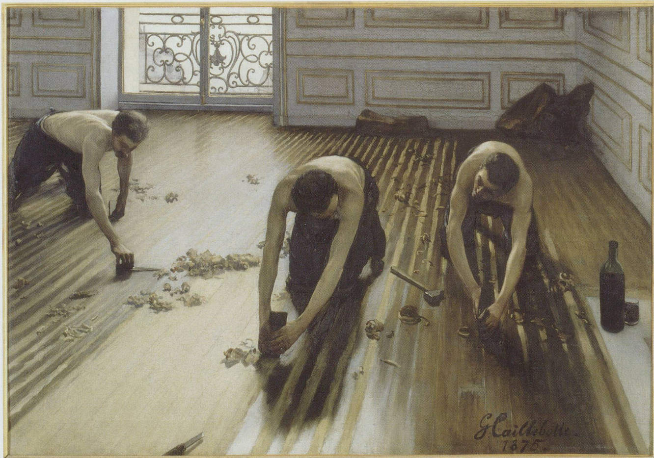
GUSTAVE CAILLEBOTTE (1848–1894), RABOTEURS DE PARQUET, 1875, MUSÉE D'ORSAY, PARIS.