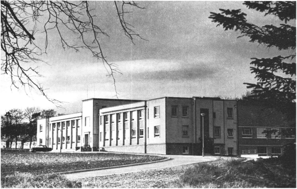
The Macaulay Institute for Soil Research