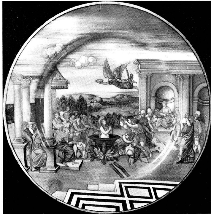
Fig. 30 Dish, The Martyrdom of St Cecilia . By Nicola Pellipario. Signed «NICHOLA» (in monogram) and inscribed «I historia de Sancta Cecilia la quale e fata in botega de guido da castello durante In urbino 1528». Diam. 50.0 cm. Museo Nazionale, Florence.