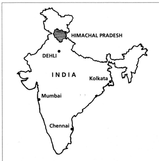
Fig. 1: India (Himachal Pradesh).

passes. Yarkandi and Ladakhi traders were usually engaged in transporting charas ( cannabis extract) from Leh to Kulu. 18 The upper reaches of the Beas (in Kulu) and the Satlej (in Rampur-Bashahr) valleys were usually the southernmost point to which traders from the trans-Himalaya came. In the category of trans-Himalayan traders may, perhaps, be included the people of the Lahual and Kinnaur areas of Himachal Pradesh.