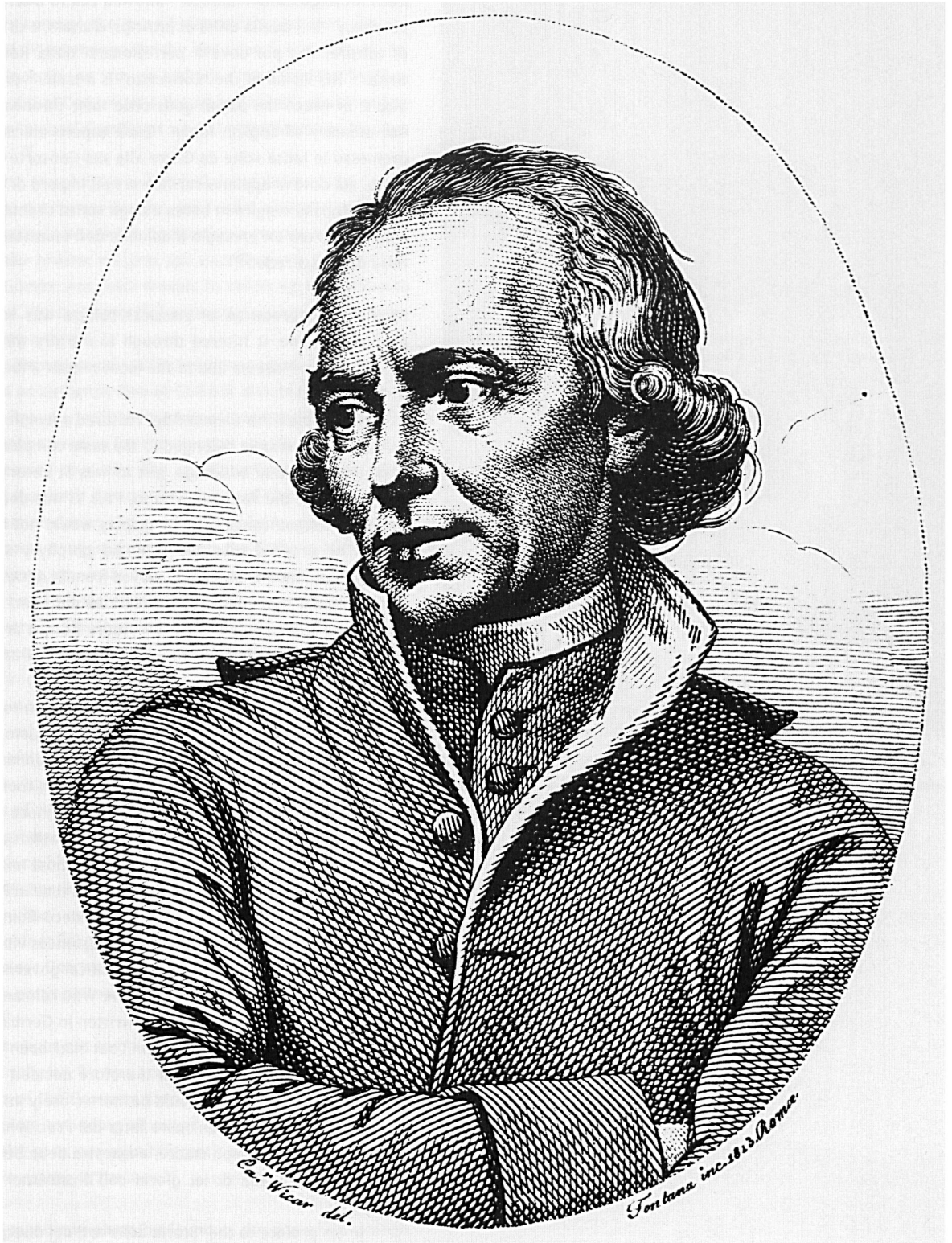
Fig. 2: Carlo Fea, Engraved Portrait after a design by Jean-Baptiste Wicar (1813). (Fea, Carlo, Varietà di Notizie economiche fisiche antiquarie sopra Castel Gandolfo Albano Ariccia Nemi loro laghi ed emissarii , Rome: Bourlie, 1820.)