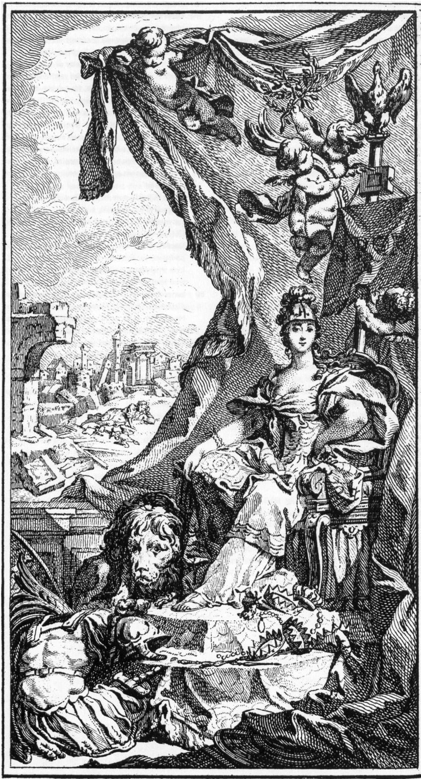
Fig. 1: Etching after a drawing by Charles Eisen, Frontispiez, in: Charles de Secondat, baron de Montesquieu, Considérations sur les Causes de la Grandeur des Romains, et de leur Décadence , Paris: Huart, Moreau, 1748.