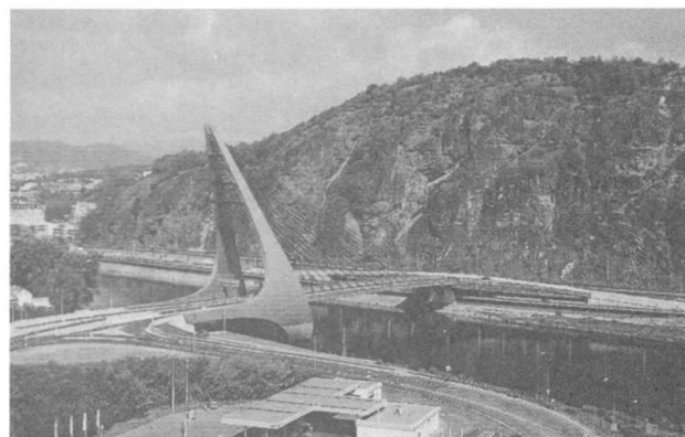
Fig. 3 Overall view towards the Marian Rock

In the case of the Marian Bridge it was on one hand the close cooperation of the bridge and traffic engineers with the architect and on the other hand the will of the city to build the bridge, which has next to the medieval castle become a new symbol of the modern era as a part of the environment and everyday life of city residents and its visitors.