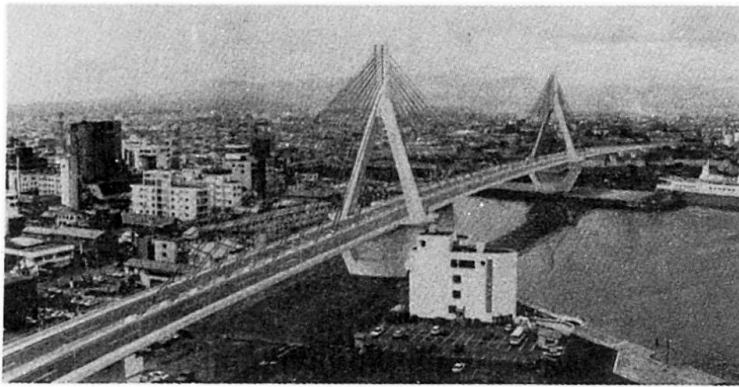
Fig. 5 Photomontage of completed Aomori Bay Bridge

The Aomori Bay Bridge, whose opening is scheduled for the summer of 1992, is now at the final stage of construction and is beginning to unveil itself. It is believed that various aesthetic considerations, as well as the unique structure of a cable-stayed bridge, will dramatize the existence of the bridge (Fig. 5).