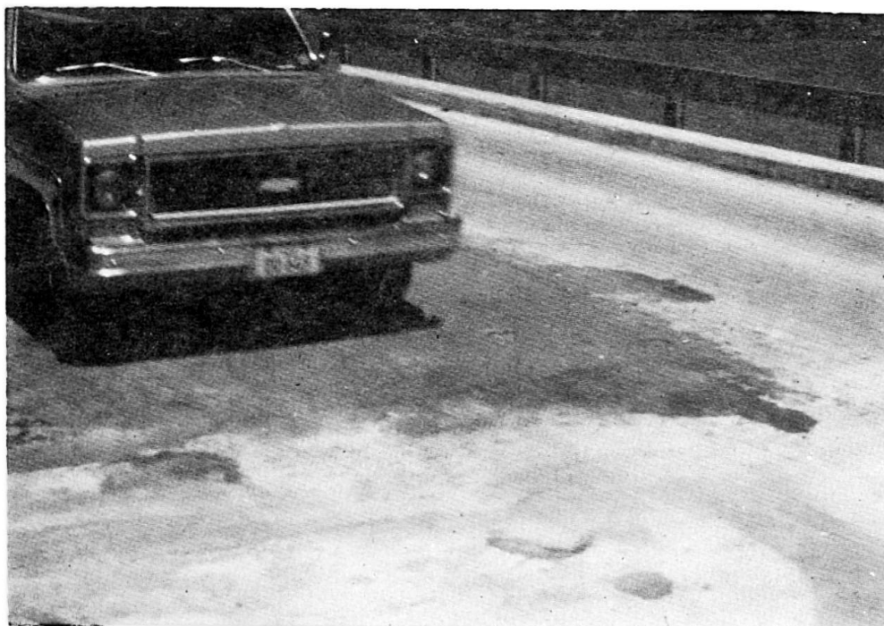
Fig.4 Bridge deck repaired by polymer concrete