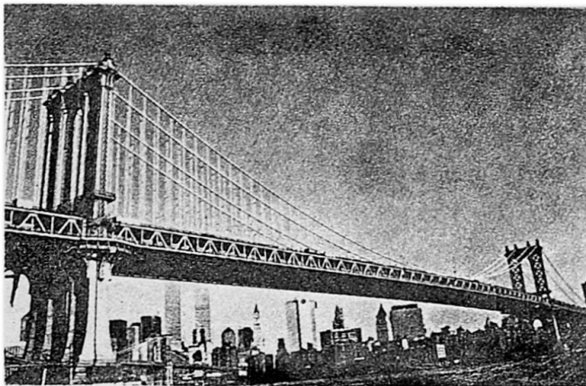
Manhattan Bridge, New York, USA

Project Engineer Steinman Consulting Engineers New York, NY, USA