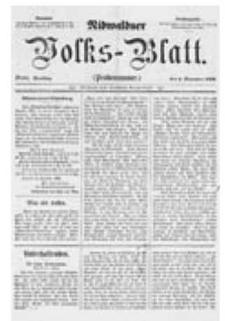
Nidwaldner Volksblatt, 1.12.1866