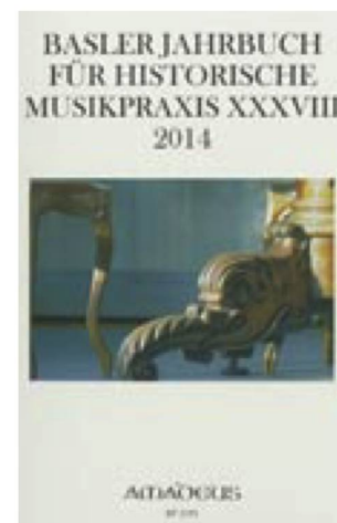
Basler Jahrbuch für historische Musikpraxis vol. 38, 2004