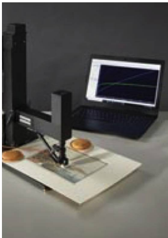
Using a microfade tester to determine how long an object can be exhibited for.

The National Library has been collecting websites from Switzerland for more than a decade, and is continually expanding its representative collection of the information disseminated via this medium. In 2020, a web collage was developed as an entertaining way to access the more than 64 000 snapshots of websites, and is available to users in the public rooms of the NL. It starts with a collage of homepages resembling a pixel raster, from which users can zoom in as they wish for a closer look at websites that are visually appealing or contain interesting content. They can then navigate within the archived websites just as when using the internet in the normal way. A specially developed web application allows the web archive collection to be explored in an intuitive and fun way.