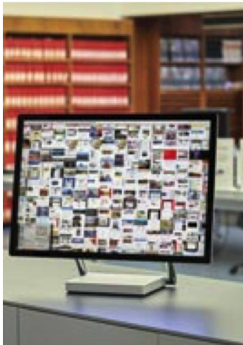
Web archive: monitor in the public area