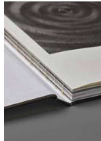
Original binding with visible stitching

The cataloguing backlog in the General Collection resulting from the change of library management system in 2019 was prevented from growing further, but the interruptions to on-site cataloguing due to the pandemic meant that there was no opportunity to reduce it. At the end of 2020, just under 10 000 works were still waiting to be catalogued. However, staff working from home made extensive progress in enhancing data quality, with the primary access points (authority records) in particular being improved and brought into line with the requirements of the international Integrated Authority File (GND) . Preparations for displaying electronic publications in the national bibliography The Swiss Book were completed, so that this function will be available from issue 2021/01 onwards. Work on automated integration of the old Coris subject catalogue into Helveticat continued, in association with the University of Applied Sciences and Arts Western Switzerland. The results have been positive, and this work will be further pursued in 2021.