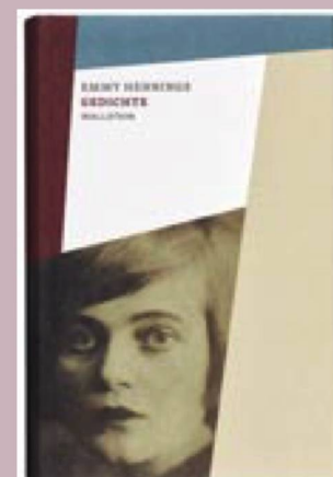
Gedichte by Emmy Hennings