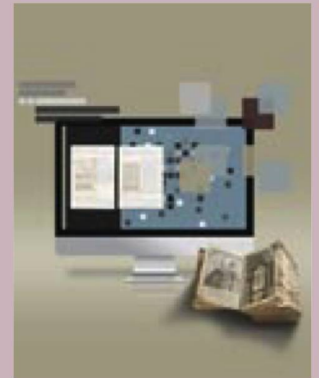
Virtual exhibition Jean Starobinski. Relations critiques

The Swiss National Sound Archives were involved in the Cultura in movimento project, which was organised by the Canton of Ticino to mark the opening of the Ceneri Base Tunnel. Owing to the pandemic, the planned travelling exhibition in Ticino museums had to be replaced with a virtual format. The National Sound Archives put together a selection of historical audio documents and published them on their website to coincide with the opening of the tunnel on 13 December 2020. With interviews, reports, conversations and songs of the old mail coach that traversed the Gotthard until the late 19 th century, right up to the modern, high-speed line of the 21 st century, this was a gallery of living memories telling the story of the development of transport routes and the transformations of society in both Ticino and Switzerland during the 20 th century.