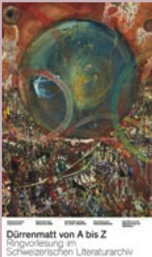
Dürrenmatt von A bis Z: a cycle of 14 lectures