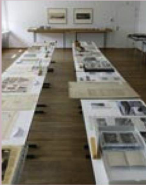
View of the exhibition marking European Heritage Days