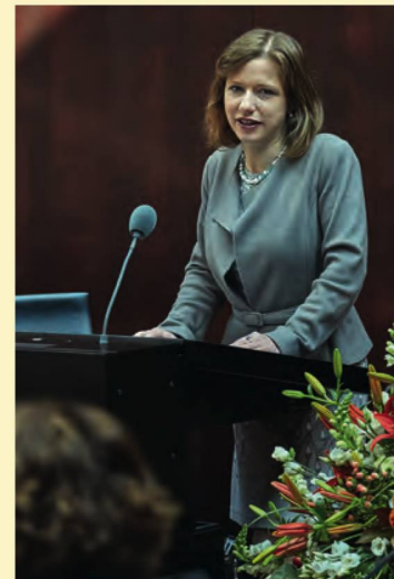
Christa Markwalder, Vice President of the National Council, opens the Annual Meeting of the CENL, 18.05.2015