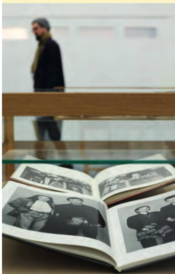
The Photobook and its Authors , 28.11.2015–13.2.2016