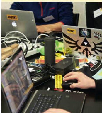
Cultural Data Hackathon, 27./28.2.2015