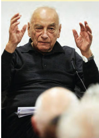
Eugen Gomringer, 19.11.2015