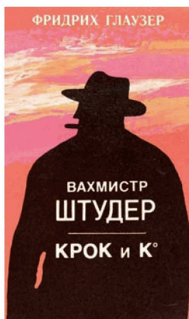
Wachtmeister Studer in Russian: St Petersburg, Kult-inform-press, 1992, Sig. Nb 61124