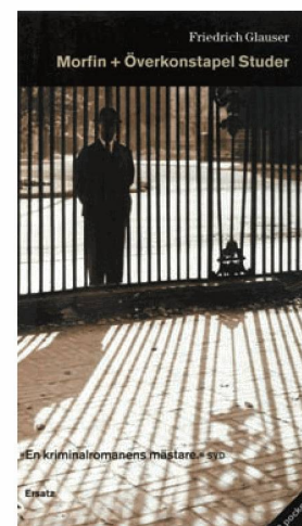
Friedrich Glauser's Wachtmeister Studer in Swedish: Stockholm, Ersatz, 2008, Sig. N 290626

A further advance in standardisation comes in the form of the German National Library's Gemeinsame Normdatei (GND, Combined authority files), which combines the various cataloguing regulations into a single entity. From early 2012, the GND will be introduced for subject indexing. There are also plans to use it for alphabetical cataloguing, but further studies will be required before this is implemented. The GND will also replace the Schlagwortnormdatei (SWD, Keyword authority control), for which the only Swiss clearing house has long been run by the NL. The major academic libraries of German-speaking Switzerland established their own SWD clearing houses during 2011.