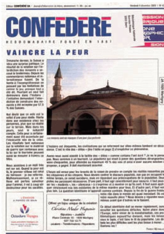
One of the digitised newspapers: Le Confédéré , title page of the 12 April 2009 issue