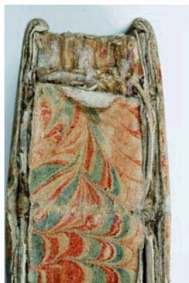
Before conservation: spine, posters