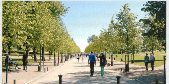
Lime tree path in the Kaivopuisto park, Helsinki, with «Treegator» water management, a system coming from England.