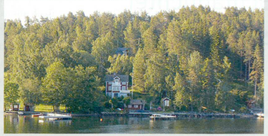
Typical landscape between Helsinki and Stockholm.

Walking in the Kaivopuisto park in Helsinki and on the sea front, was the occasion to discover other landscape man-