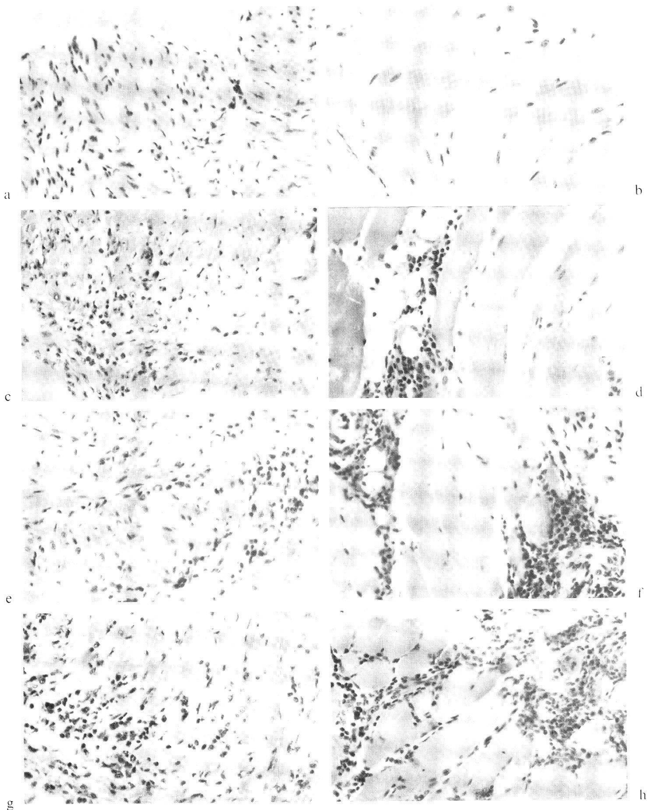
Fig. 1. Myocarditis and myositis (skeletal muscle) intensity differences in adult Swiss mice: a) control mice normal myocardium; b) control mice normal skeletal muscle; c) mild myocarditis, nodular inflammatory infiltrate; d) mild myositis, perivascular and interstitial mononuclear infiltrate can be seen; e) moderate myocarditis: diffuse inflammatory infiltrate in the ventricular wall; f) moderate myositis: diffuse inflammatory infiltrate among the muscle fibres; g) severe myocarditis: a diffuse mononuclear infiltrate can be seen beneath the epicardium and among the ventricular fibres; h) intense myositis: severe muscle atrophy with replacement of adipose tissue; scanty infiltrate remains among the muscle cells.