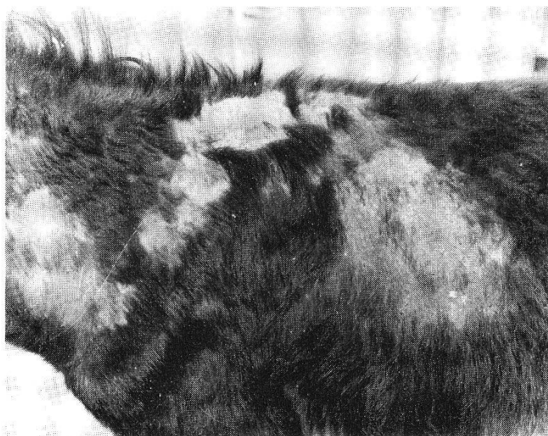
Fig. 2. Donkey No. 3, five weeks after infection with a goat strain of S. scabiei , showing linear spread of lesions on the back, wither and base of the neck.