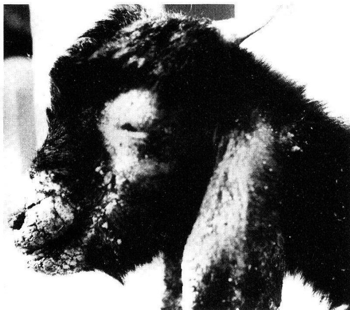
Fig. 1. A field case of severe sarcoptic mange in a goat showing thick fissured scab on the lips, muzzle, bridge of nose, round the eyes, on the cheeks and ears.

an extensive study on the genus Sarcoptes scabiei and concluded that it contains only 1 valid but variable species.