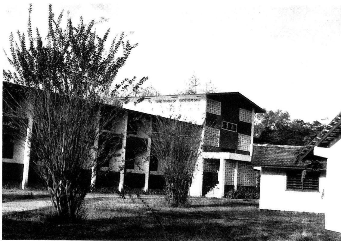
Fig. 3. South façade of the students hostel at Ifakara.