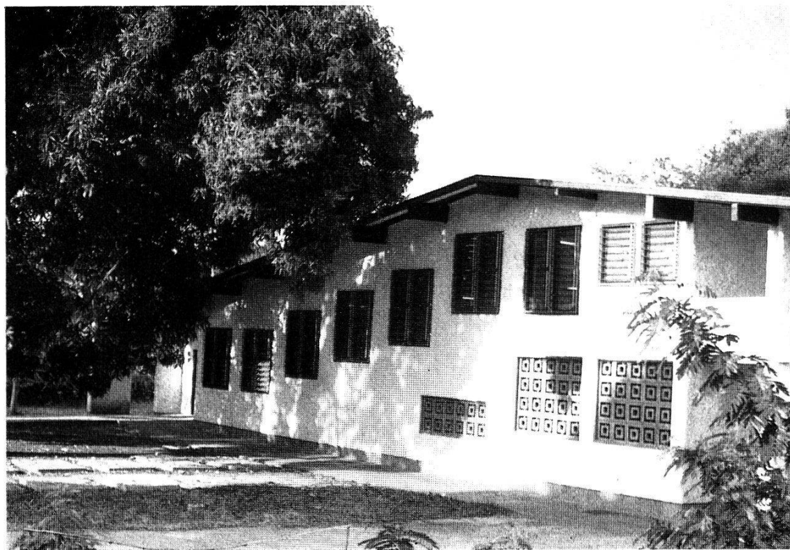
Fig. 1. Auditorium of the MATC in Ifakara, capable of seating 120, viewed from the west.