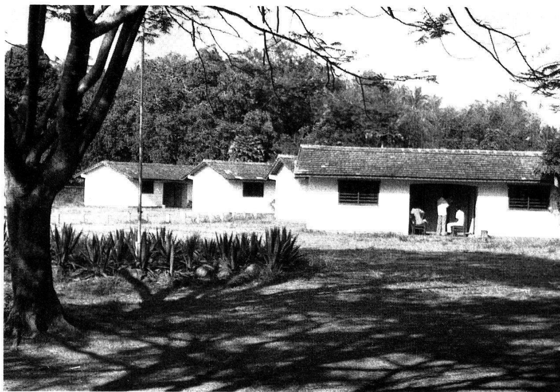
Fig. 2. Student bungalows in the MATC compound.