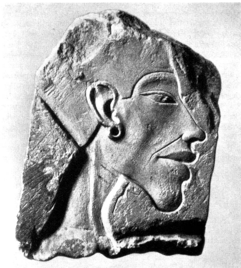
Fig. 3. Pharaoh Akhenaten, head. Fragment of a relief. Berlin, Staatliche Museen.