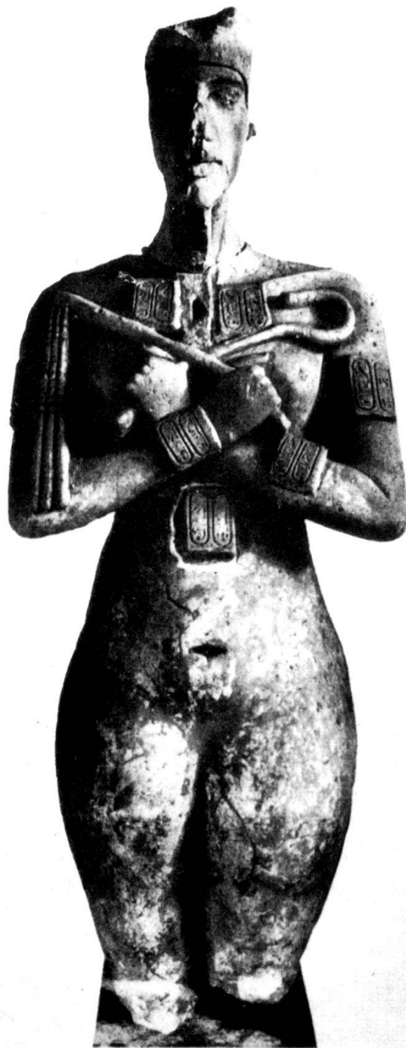
Fig. 2. Pharaoh Akhenaten – torso of a painted colossal sandstone statue from the destroyed Aten temple at Karnak, excavated by the Egyptian Antiquities Service, 1926–1932.