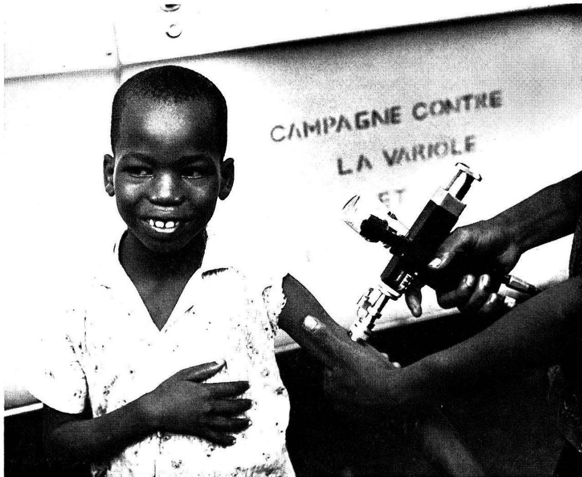
The Ped-O-Jet model automatic jet injector.