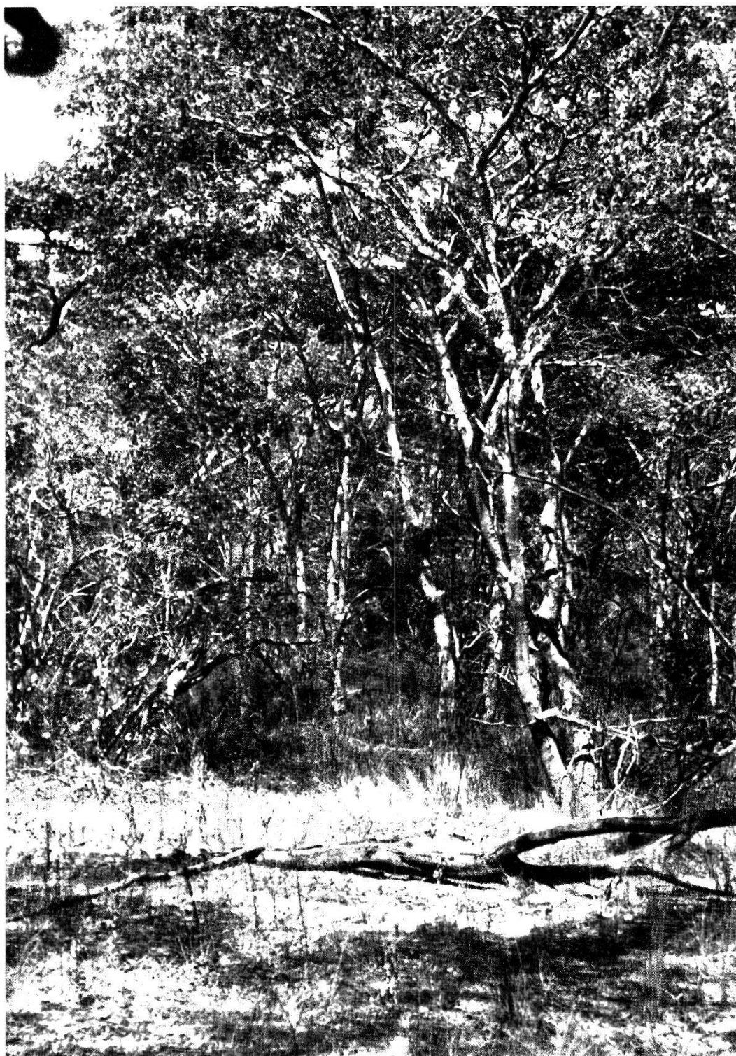
Fig. 3. Singida, cool season. This shows the typical Pseudoberlinia-Brachystegia woodland with sparse grass. Under the log in the foreground were six pupae.