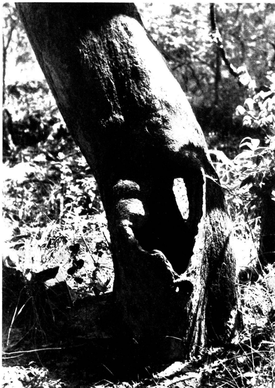
Fig. 20. Kahama, hot season. A large rot-hole in a Vitex doniana about fifteen inches in diameter. The soil inside was at ground level and in it there were one pupa and six empty puparia.