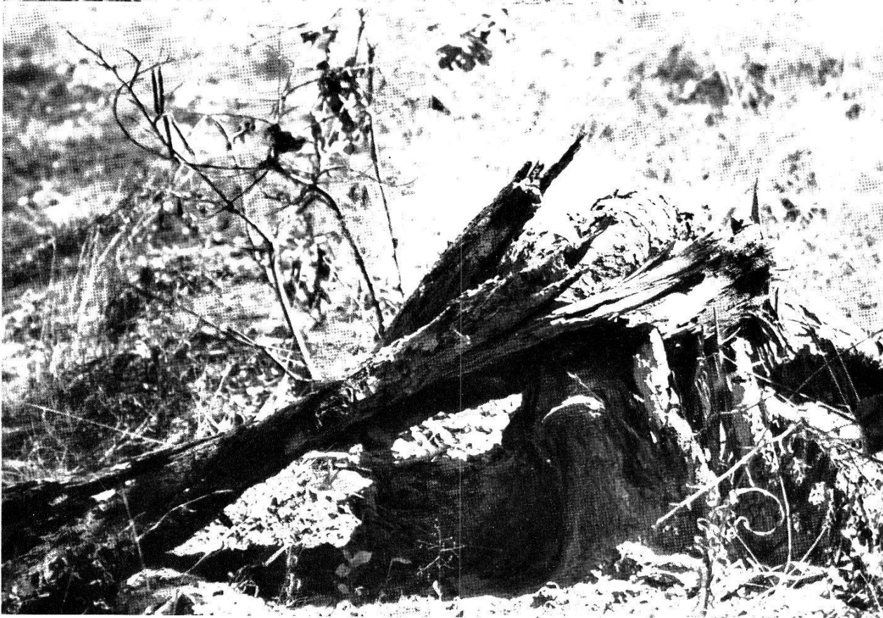
Fig. 6. Singida, cool season. This log had slight shade most of the day. Four pupae were found under the fork on the left and a further four under the slight bulge on the right. Another pupa was taken here in the rains.

Fig. 7. Singida, cool season. This tree stump with the bark leaning up against it was very similar to many logs where the trunk was broken off just above the ground. There were four pupae under the end of the bark on the ground while two cases were near the stump. There was another pupa under the bark in the rains.