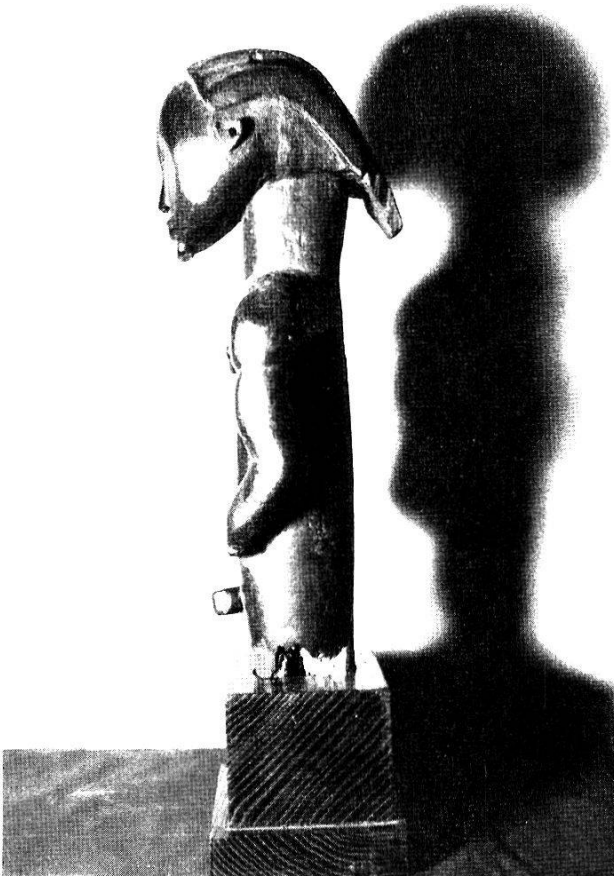
Fig. 3 a.