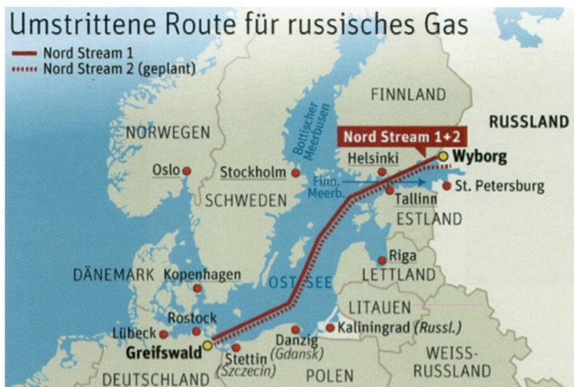
Fig. 3: