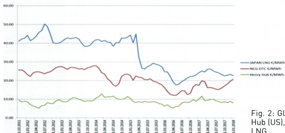
Fig. 2: Global Gas Prices of Henry-Hub (US), NCG (Germany) and Japan LNG.

In the Winter 2016/17 the two nuclear plants Beznau I and Leibstadt were nearly the whole winter out of service because of important repairs. Therefore by the end of January 2017 after 2 very cold months the average level of the Swiss barrier lakes was already down to 27%, leaving only little water reserves for the rest of the winter (Fig. 5). Luckily in February/March 2017 the weather turned to be rather warm, so the limited water reserves could be managed by more electricity imports. If the barrier lakes are empty too early, we would lose around 8