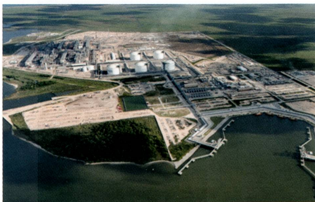
Fig. 1: Sabine Pass LNG-Terminal (Louisiana USA).

Today the main market drives of global gas market is Henry Hub, representing the US gas market, Net Connect Germany (NCG) representing the European gas market and Japan LNG Hub representing the Asian market.