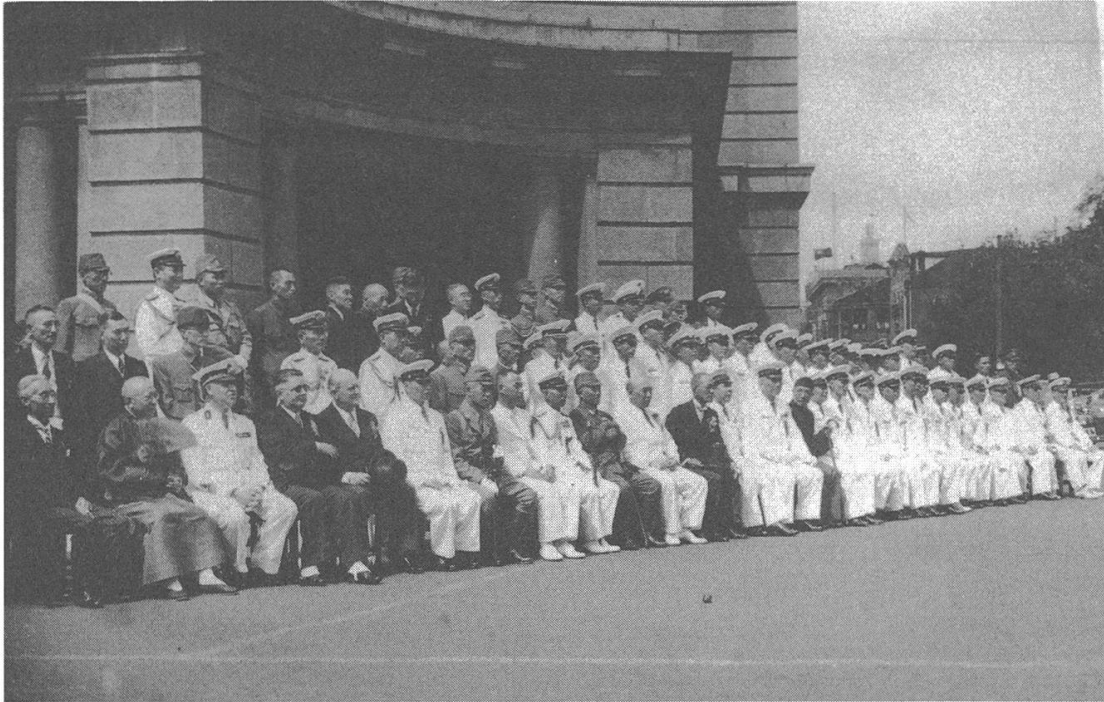
Illustration 3: “Guests at the farewell of the intern. Zone”. (See also note 23)

fourth from the left) as a prominent participant in the event. He is visually instrumentalised as evidence of international acceptance of a new Chinese nationalism in Shanghai, thereby bestowing legitimacy on the new political system.