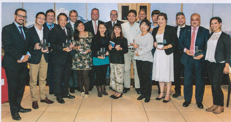
The champion sellers of independent Swiss tours in 2015: ST invited the ten most successful Asian travel agencies to Thun to collect their awards and celebrate with representatives of ST and the industry.

The aim of this initiative was to attract independent travellers from long-haul markets who typically stay longer than average in the country. Thanks to a promotions and training programme, ST succeeded in getting over 10,000 travel agencies to persuade their customers to book trips to Switzerland of at least four days. As an agent incentive, a special loyalty programme was offered by GTA, the largest Asian supplier for independent travel. ST assessed that this initiative netted an extra 20,000 hotel nights booked.