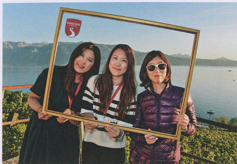
The backdrop of your dreams: media movers and shakers at Lavaux during a media trip.

This year, ST's key international media trip was held at Lake Geneva. 139 travel journalists from 35 countries accepted a joint invitation from ST and Lake Geneva Region, and enjoyed some of the outstanding attractions along the Grand Tour of Switzerland. They were then divided into smaller groups to experience the diverse regions further east. These included the unique Alpine routes of Graubünden, the Rhone Valley, the urban charms of Bern, Fribourg and St. Gallen, and the castles of the Aarau region. The media coverage generated was worth around CHF 5 million in advertising value.