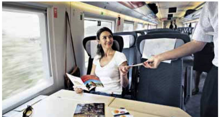
Rides in the high-speed AVE train from Madrid to Barcelona took on a captivating Swiss flavour.

To create the “holiday passport”, which invited guests to discover the colourful Swiss autumn with its glorious natural landscapes and wealth of living traditions, ST produced attractive offers while SBB (Swiss Federal Railways) and the Swiss Association of Public Transport came up with unbeatable prices. The off-season campaign paid off, resulting in the sale of 15,000 holiday passports and 65,000 companion tickets, and generating more than 1,600 direct bookings.