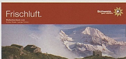
Central motives of the summer campaign 2003.