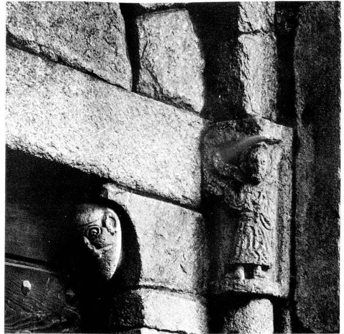
Sculptures on the church of San Nicolao at Giornico/Ticino.

Those who want to turn South already at Martigny, will find a specially lovely church tower at Bourg-St. Pierre, on the road to the Great St. Bernard Pass, shortly before the entrance to the motor tunnel. It is one of the oldest Romanesque towers on Swiss territory.