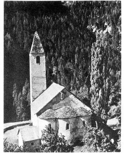
The pre-Romanesque church of St. Peter, at Mistail in the Grisons.

The last stage in our journey in the Grisons takes us to Santa Maria in the Münstertal. The group of Romanesque buildings of the Benedictine monastery founded by none less than Charles the Great, is something unique. Anyone interested in Romanesque Switzerland should visit Santa Maria, even if it is in the most remote corner of the country. It is thanks to its isolated position that the whole complex has remained pure and untouched. The church dates back to the eighth century, and is therefore rather pre-Romanesque. Its interior is completely painted. The three apses, its frescoes, the statue of its founder, the