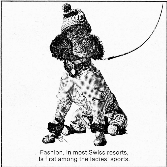
Fashion, in most Swiss resorts, is first among the ladies' sports.