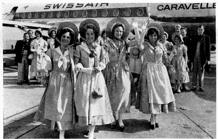
Genève Chante leaving Geneva by Swissair