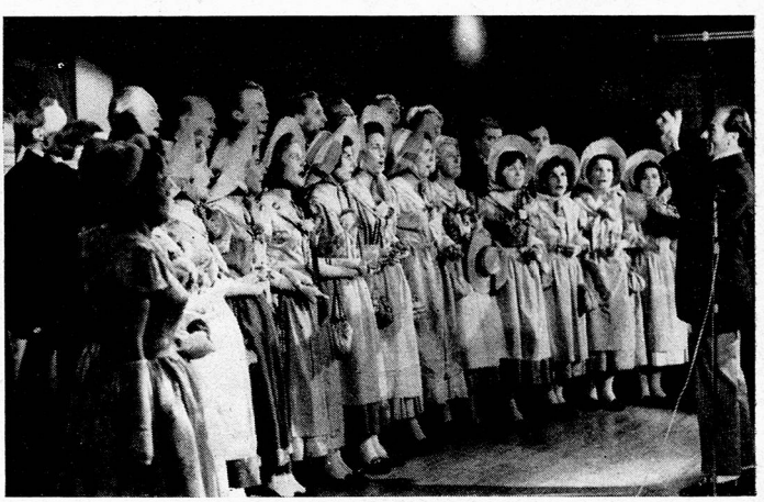
Geneva sings — delightfully.