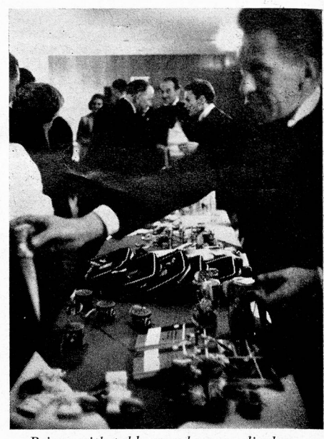
Prizes with table numbers on display

And so it came about that we journeyed to the Carlton Tower Hotel in London's fashionable Knightsbridge district on a beautiful, warm May evening of a kind only to be enjoyed in the British Metropolis. That it happened to be the thirteenth can't have deterred many superstitious invitees, for as many as 350 guests assembled in the attractively appointed ball room with its gaily decorated tables and subdued lighting.