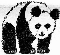
Regd. Trade Mark

Everyone adores them they're so so gay and colourful in a variety of designs :— stripes, spots, checks and tartans. Also self colours in satins, taffetas, failles and petershams. Ask for "Panda" and know you are buying the best.