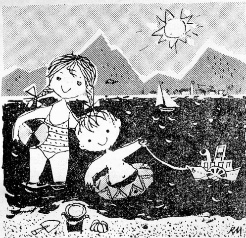
Swiss National Tourist Office, 458, Strand, London, W.C.2

Please let your English friends know that SWITZERLAND OFFERS BEST VALUE FOR MONEY