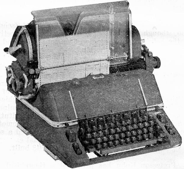
HERMES INTROMAT Bookkeeping Typewriter for "3 in 1" posting without carbon paper. Produces Ledger Card, Statement and Journal in one operation.

This extensive increase in the supply of office machines has gone hand in hand with steady