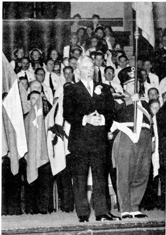
General Guisan speaking at the " Fête Suisse " at Central Hall.