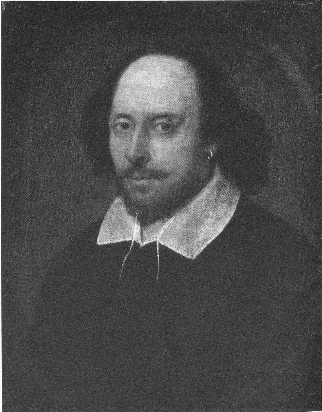
Figure 3: Attributed to John Taylor. William Shakespeare? , known as the Chandos portrait. c. 1600-10, oil on canvas, NPG 1.

What the portrait and portraitist put the now widely known of the portrait, this was not always the case. For all their claim to authenticity, scholars have done much to discredit the