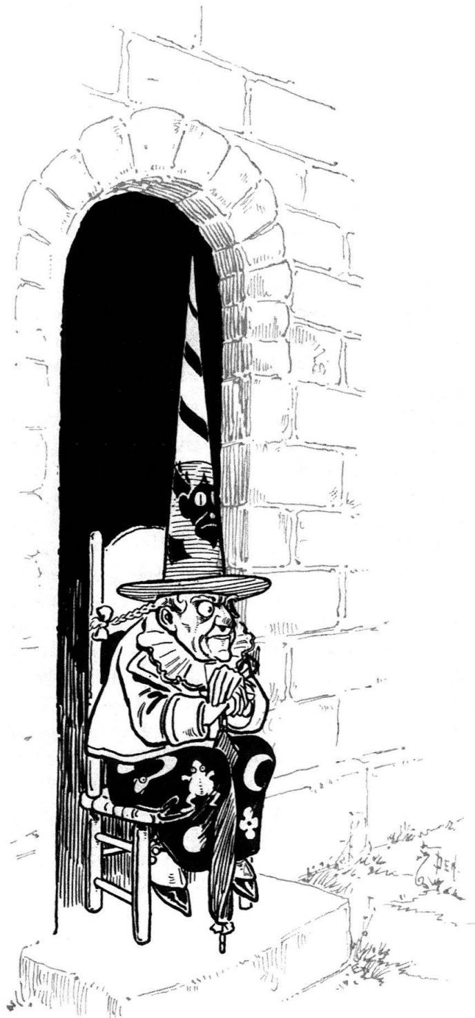
W.W. Denslow's The Wicked Witch of the West on her throne.