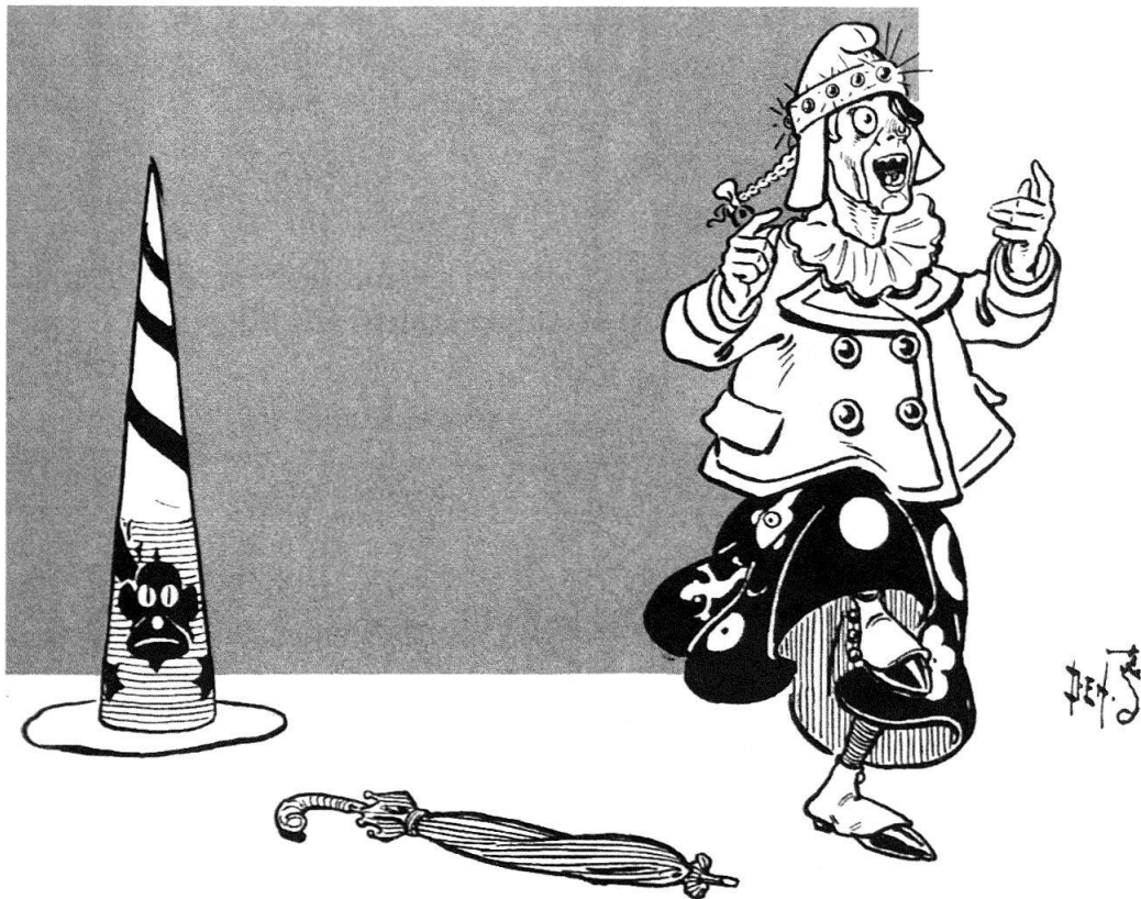
W.W. Denslow's Wicked Witch of the West calling for the winged monkeys.