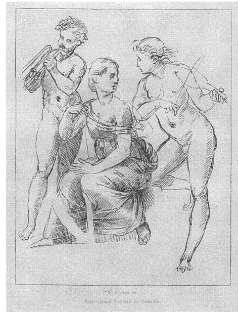
5 Print in fac-simile after a drawing by Raphael, A Concert , ex.: William Young Ottley, A Series of plates, engraved after the paintings and sculptures of the most eminent masters of the early Florentine School; intended to illustrate the History of the Restoration of the Arts of Design in Italy , London: sold by Colnaghi, Hessey, 1826, facing page 48, private collection

justify his assertion that modern artists were indebted to their late-mediaeval forebears, Ottley needs to find and to present suitable comparisons. The Italian School of Design provides this common ground since superbly reproduced specimens of drawings are included for all the masters compared in the book. And these drawings are documents that are eminently suited to a close stylistic analysis. Thus it is that the firm but free outlines of Giotto's Navicella are presented as those which taught later generations of artists the importance of a strict economy of expression (figs. 4–5). Ottley takes pains to stress the freedom of the pen, the liveliness of the lines drawn by the primitives; these features, in his view, prefigure the mastery of Raphael. 42