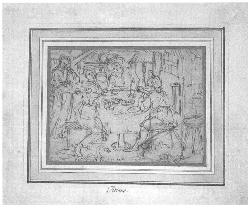
2 Annibale Carracci, Men eating at a table , pen and ink, 11,2 x 14,9 cm, with autograph mounting by Jonathan Richardson, private collection